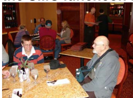
Will K9FO enjoying a light moment at the luncheon