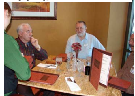
Clay N9IO discussing strategy with fellow SMC contesters