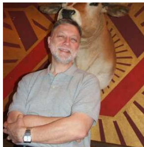
Clay, N9IO found out that all it takes is a cow, a salty scalp from a hot day at the Hamfest and you gotta Cowlick!