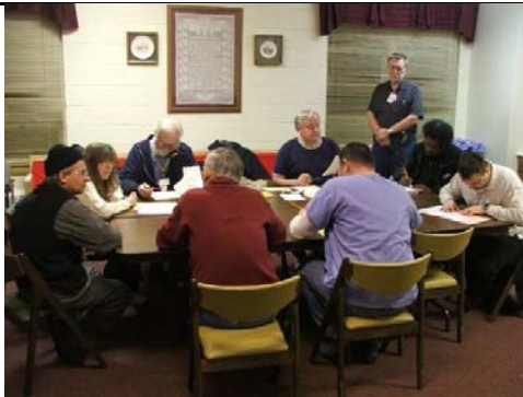
Last months busy exam session Quiet please!